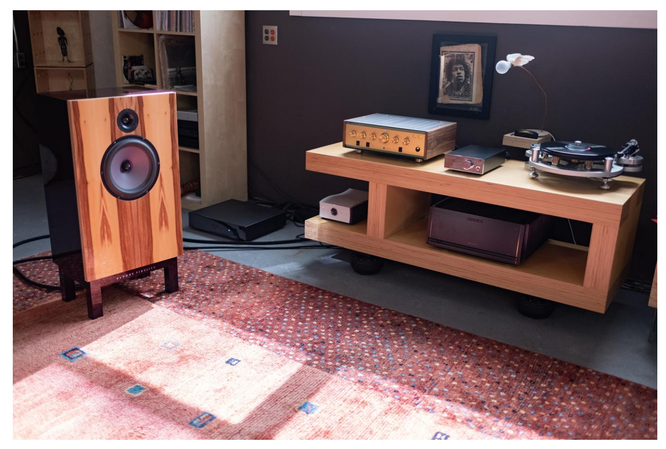
The EAR Phono Classic sat where every other phono stage in this mini Phono Stage Survey took up residence on the Box Furniture 'Fallen A' rack in a system comprised of the Michell Gyro SE