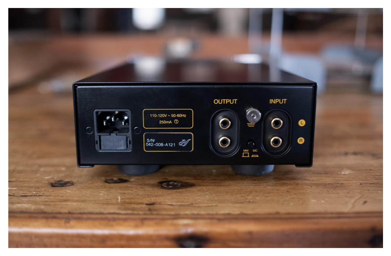
Two pair of single-ended RCAs take care of in and out connectivity with a grounding terminal between the input and output sides, while an IEC inlet completes the simple backside story.